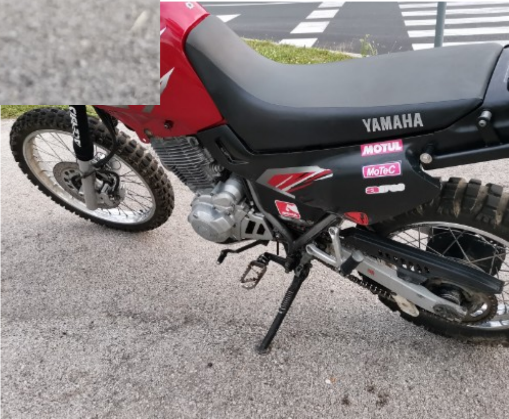
Bosley's pegs Page 9 (Total 9)