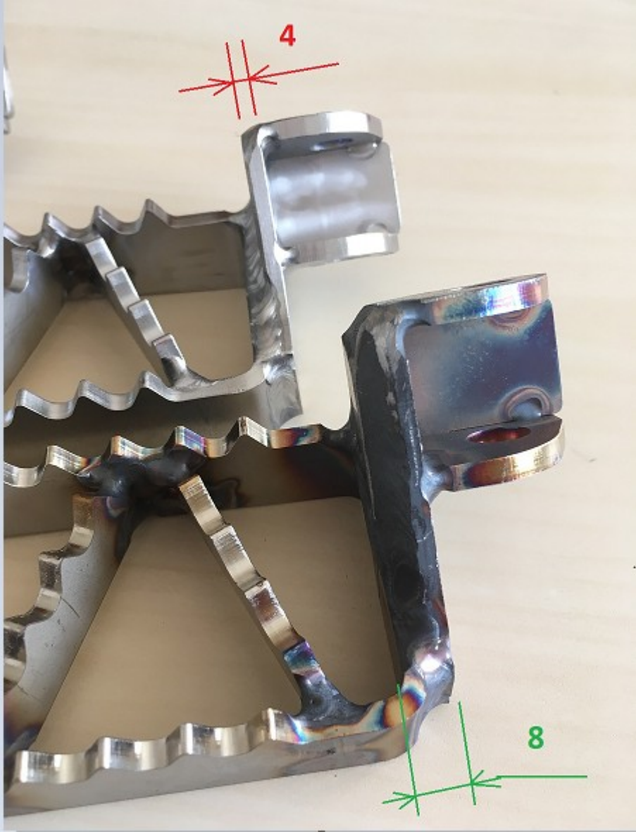
HERE compared BASE PLATE THICKNESS side-by-side