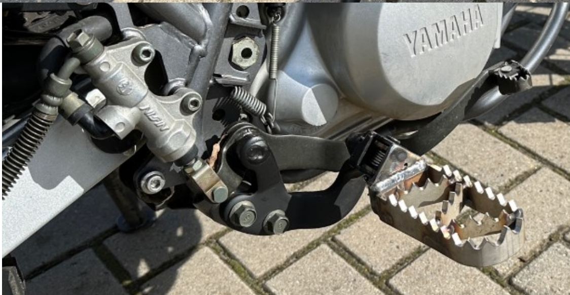
Bosley's pegs Page 8 (Total 9)