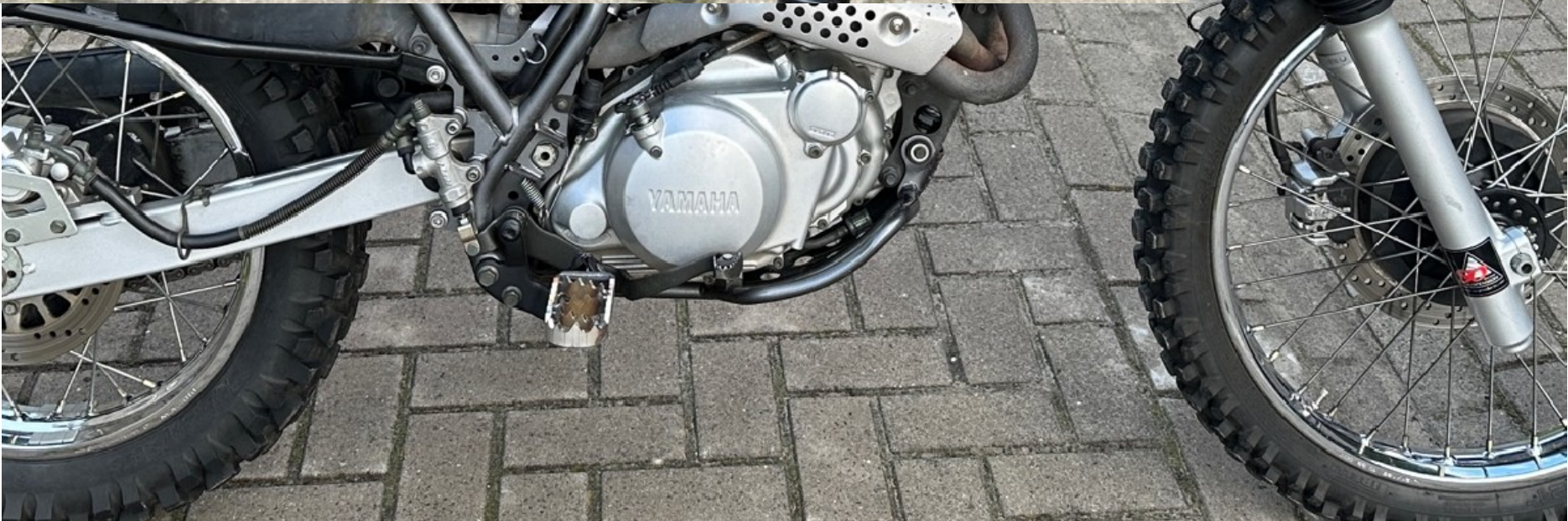
Bosley's pegs Page 7 (Total 9)